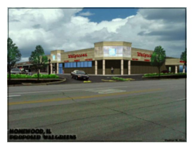
Walgreen, Chicago (1998)