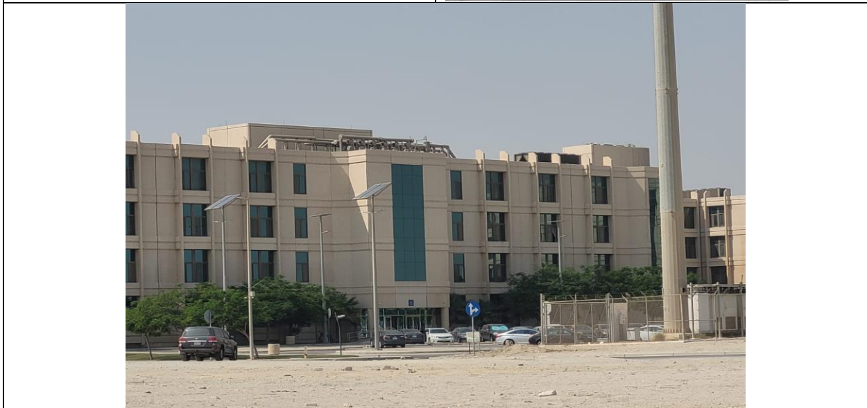
Solar Panels installed all over the campus to provide energy for the purposes of lighting, heating, cooling, running university laboratories, etc