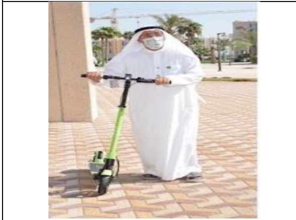
Introduction of E-Bikes