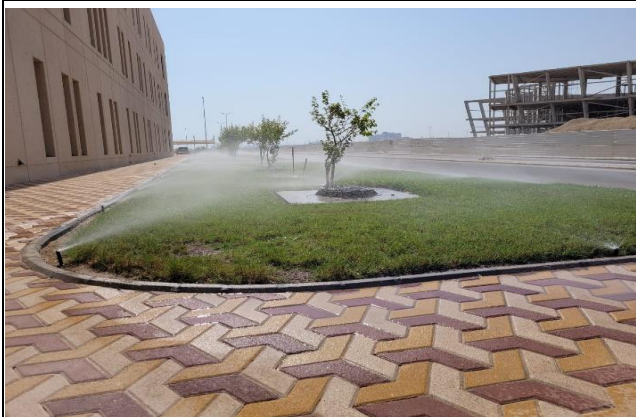
Recycled water used for gardens