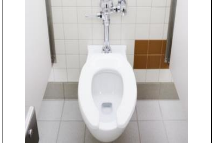
Treated water is consumed in all Washrooms