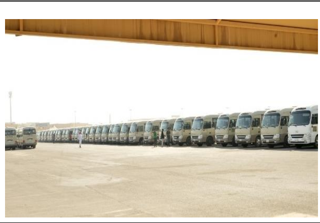
Fleet of Shuttles