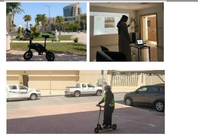
Usage of E-Bikes