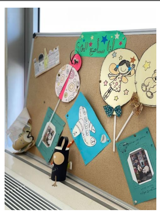
Free Child day care for IAU Faculty & Students