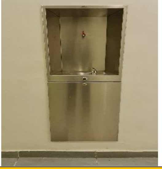
Comsumption of Clean water through dispensors installed in every college building