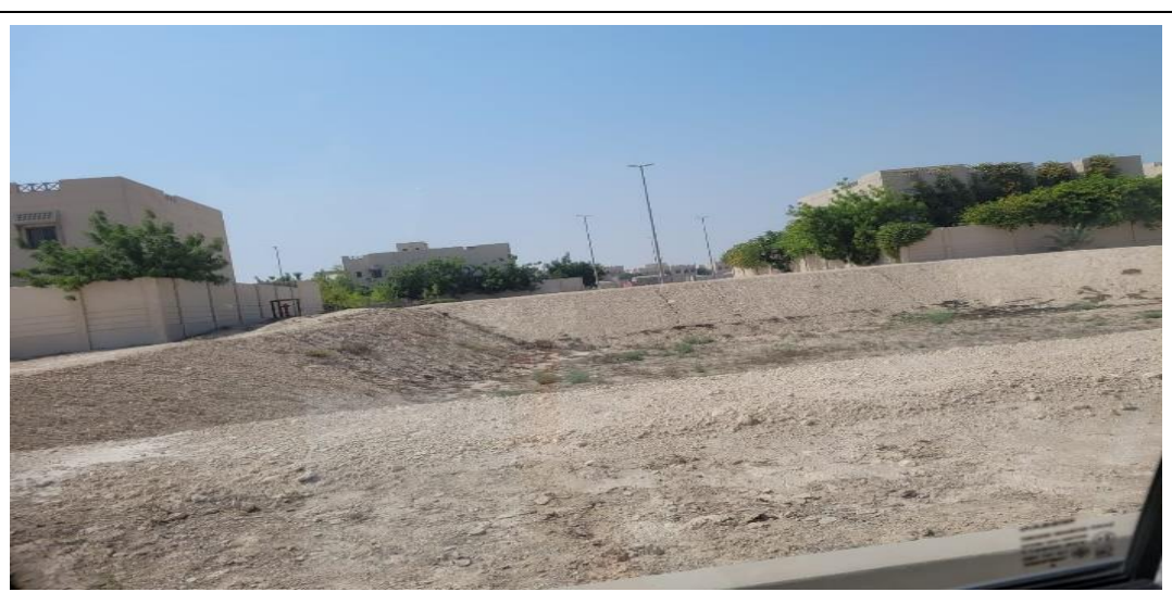
Water Collection and Storage plant