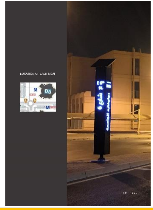
NIGHTVIEW OF SOLAR OUTDOOR SIGNAGE IN IAU CAMPUS