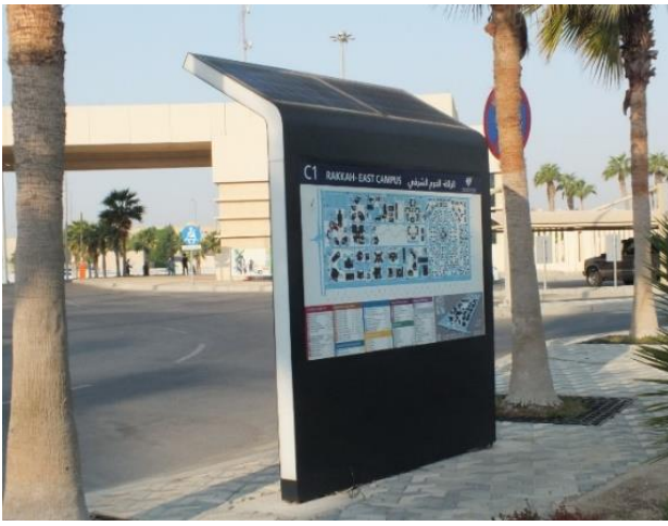
DAY-VIEW OF SOLAR OUTDOOR SIGNAGE IN IAU CAMPUS