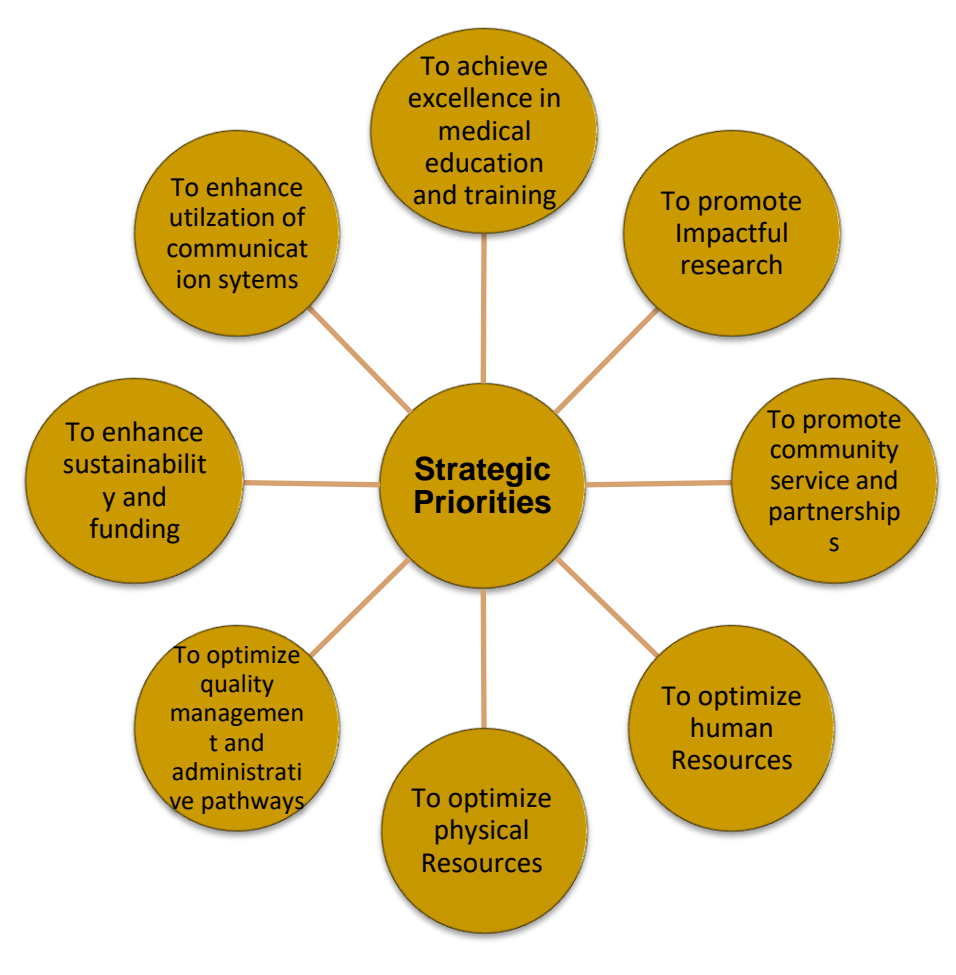
Figure 4 College of Medicine Strategic Priorities

Building on the environmental scan and SWOT analysis, the Strategic Planning Committee identified eight critical success factors that address it core functions to facilitate the proper selection of strategic goals and objectives: