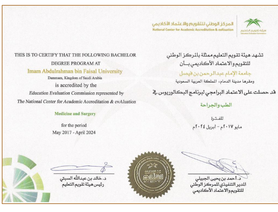
Figure Error! No text of specified style in document. NCAAA accreditation certificate