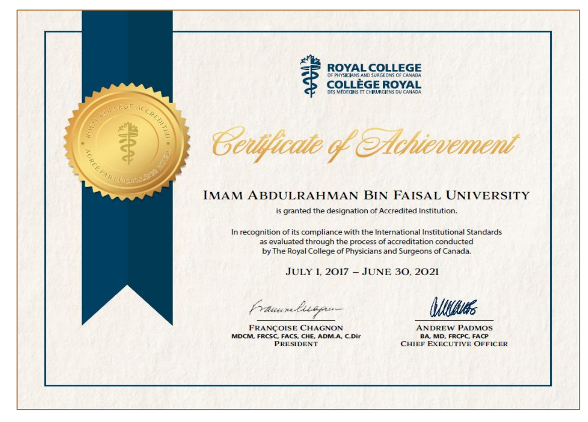
Figure 2 Royal College of Physicians and Surgeons of Canada Accreditation certificate