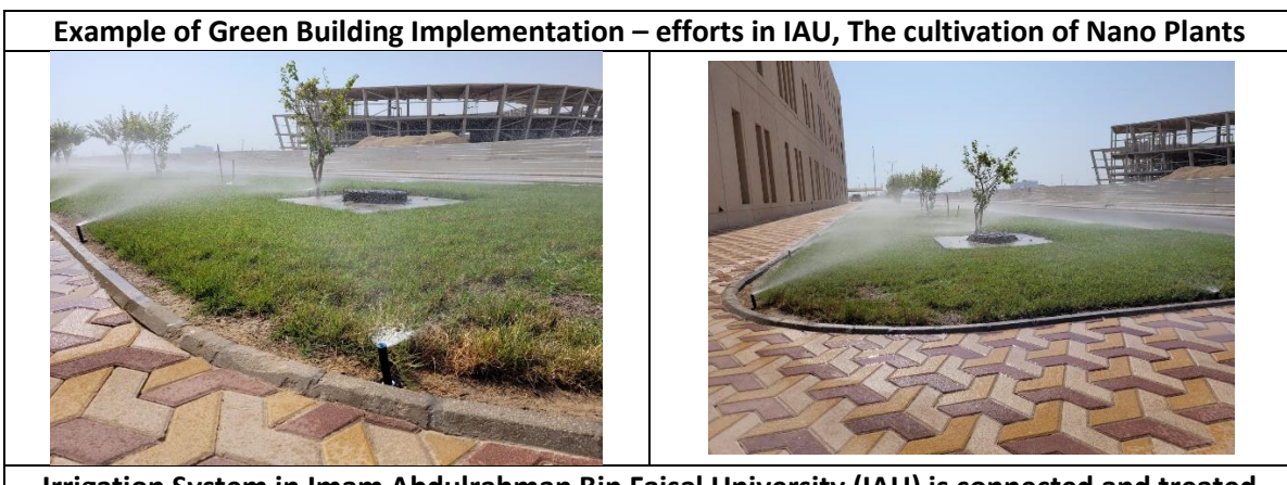
Irrigation System in Imam Abdulrahman Bin Faisal University (IAU) is connected and treated with wastewater