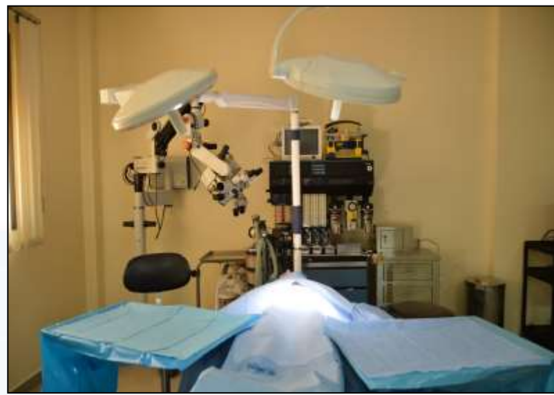
Emergency Room Laboratory