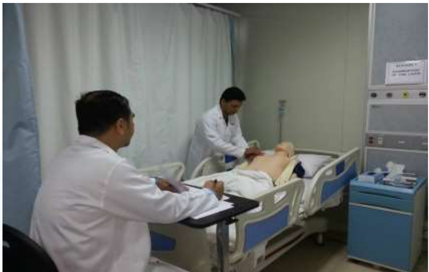
Obstetrics & Gynecological Nursing Skills Laboratory