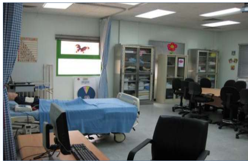
New Born Skills Laboratory