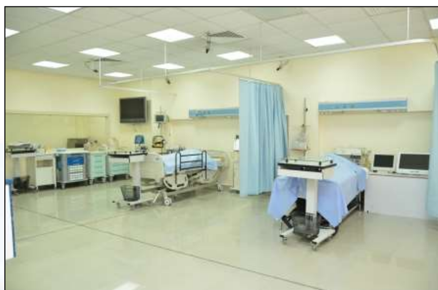
Fundamentals of Nursing Skill Laboratory