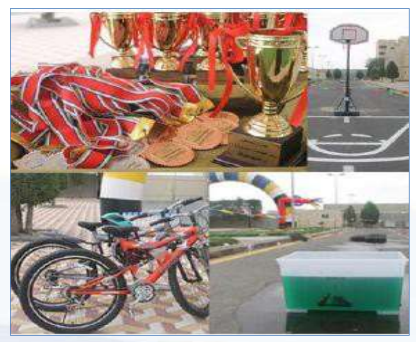
Let's Make Them Happy Campaign