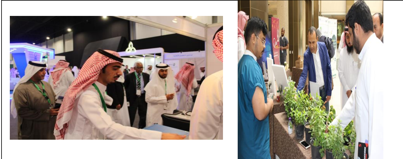
Introduction to the basic components of agriculture: Events Related to Sustainability