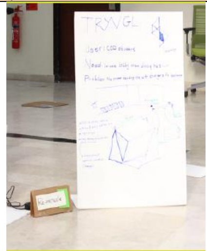
"Raskala"- Recycling materials including reusing used Laptops collection campaign