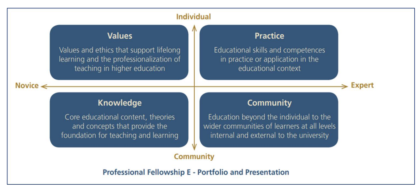
Figure 1. PFUTL Program Framework.

The PFUTL is founded in an academic development framework grounded in cultural and professional values, teaching and learning knowledge, competences and skills in practice all within the wider community and supporting the Scholarship of Teaching and Learning (SoTL). The academic-year long program is based on evidence from each module within the framework (as shown in Figure 1 below) culminating in an e-portfolio and presentation at the end of the program.