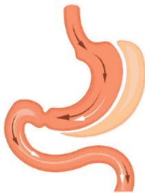
Vertical Sleeve Gastrectomy (VSG)

If the pouch formed during a Gastric Sleeve surgery is too large, it could lead to less weight loss as there won't be enough restrictions on the amount of food that can be consumed. In cases where patients experience severe acid reflux that cannot be properly treated with medication, revising the surgery to Gastric Bypass is a good option.