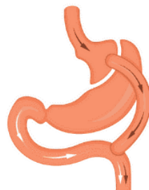
Roux-en-Y Gastric Bypass (RYGB)