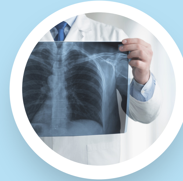
X-ray is usually the first examination the doctor performs.