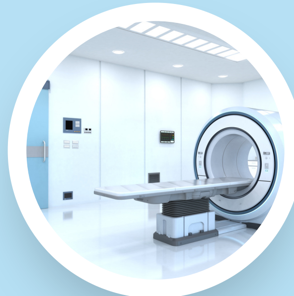
CT scan to create a detailed cross-sectional image